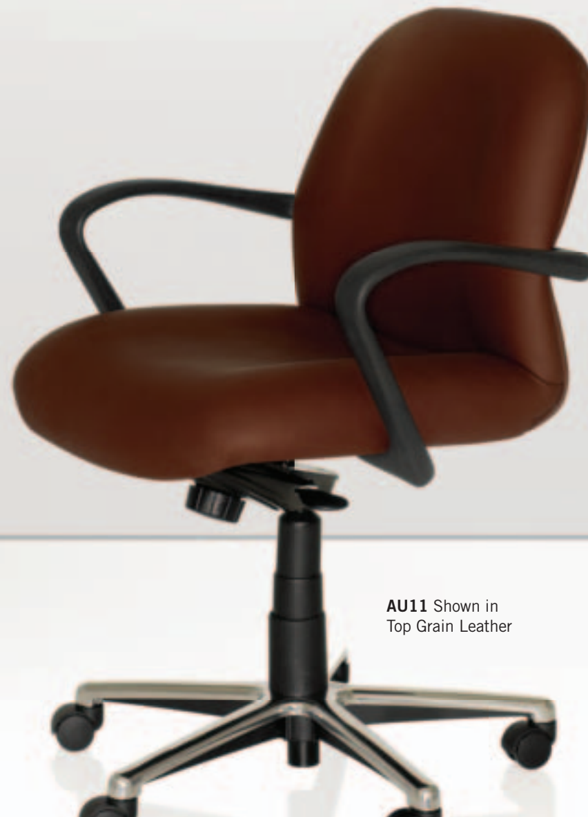
AU11 Shown in Top Grain Leather