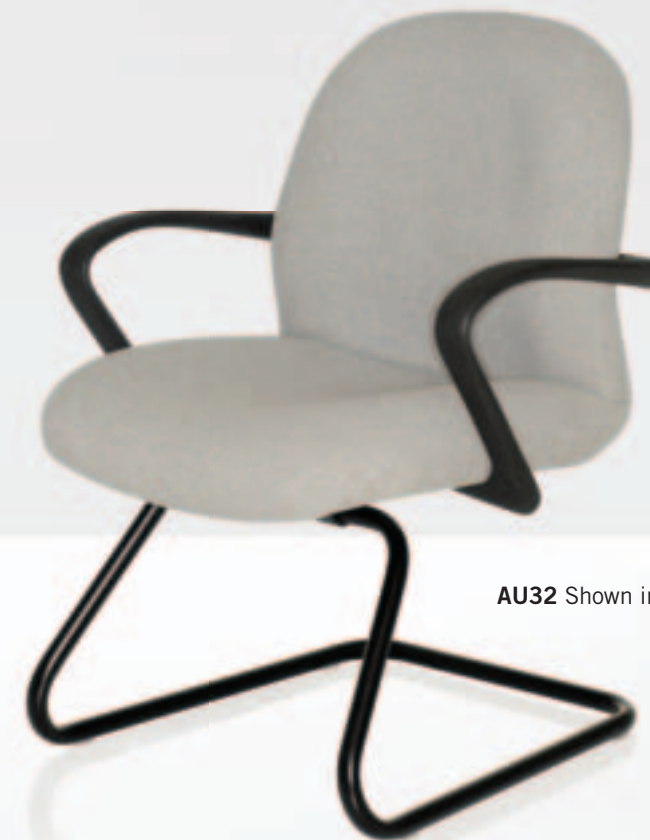
AU32 Shown in Alpha Marquesa

United Chair® products comply with ANSI/BIFMA X5.1-2002 and ISO 14001:1996 standards. Information contained herein is subject to change without notice.