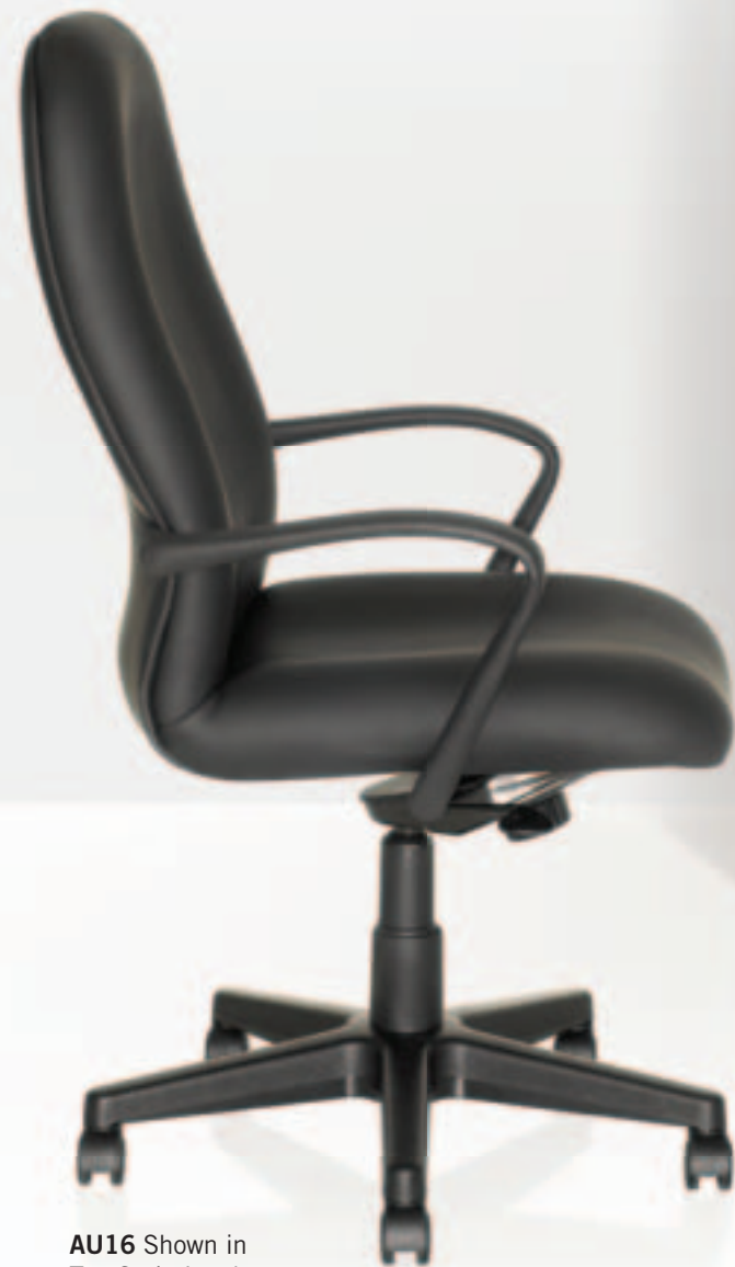
AU16 Shown in Top Grain Leather

Featuring fully upholstered backs and dramatically contoured seat and back cushioning of highly durable foam. Executive and management models have a five-legged base.