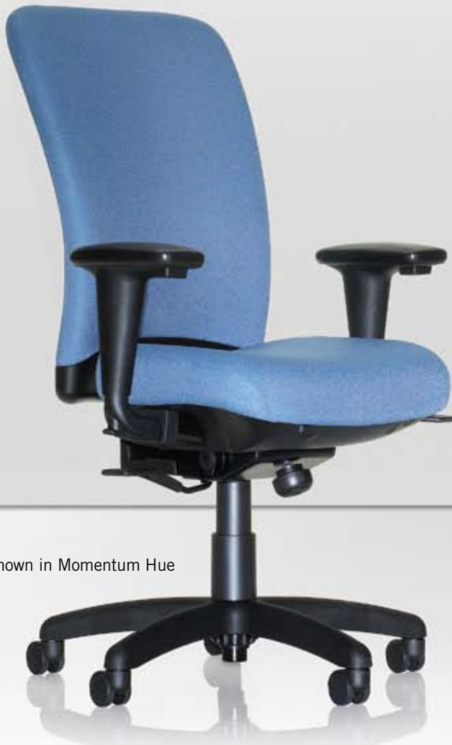
ON16 Shown in Momentum Hue