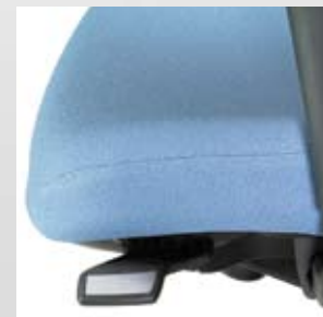
Seat sliding mechanism