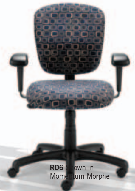
RD6 Shown in Momentum Morphe