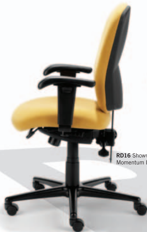
RD16 Shown in Momentum Logic

Comfortable and dependable seating support for years to come.