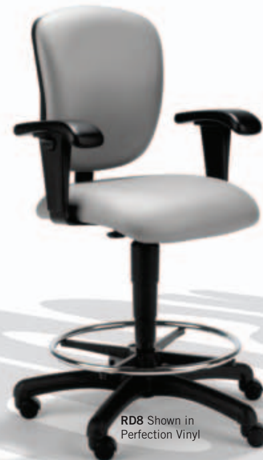
RD8 Shown in Perfection Vinyl